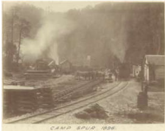
Figure 7 Camp Spur work area showing test rail c1896 (Archives of Tasmania)

48 bridges and culverts too tedious to count, some of these 120ft. to 140ft. long, mostly built of Macquarie pine 11 logs. Six girder bridges crossing the Queen River are on piles of the same lasting timber.